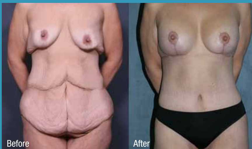
Body procedure: Abdominoplasty, buttock and thigh lift, liposuction of the medial thighs, liposuction of hips, liposuction of anterior axilla, breast augmentation, breast lift, lateral thoracoplasty.