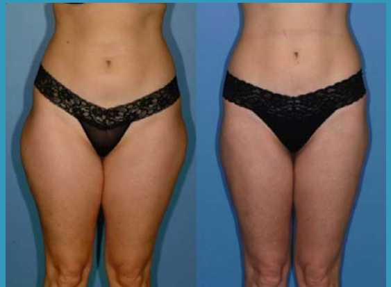
Before (left) and After (right) Liposuction Procedure.