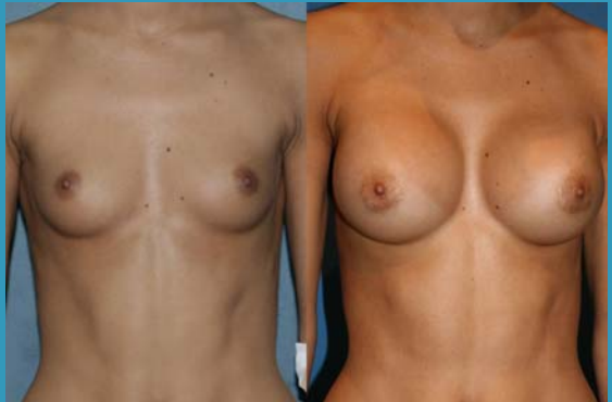
Before (left) and After (right) Breast Augmentation.